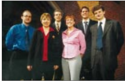
Paragon boosts its team to support growth

The company is now made up of 41 carefully selected people whose skills indicate Paragon's priorities. It says a lot about these priorities, not to mention the volume of new implementations, that 12 of the 41 are support staff. New to the team are specialists in the animal feed and third party logistics sectors, plus two top graduates from the UK's leading transport and logistics degree course, one of whom is French. French speakers have also been recruited into business development and sales, where additional staff have developed expertise in new areas, such as haulage and passenger collection. Such has been the effectiveness of the sales team